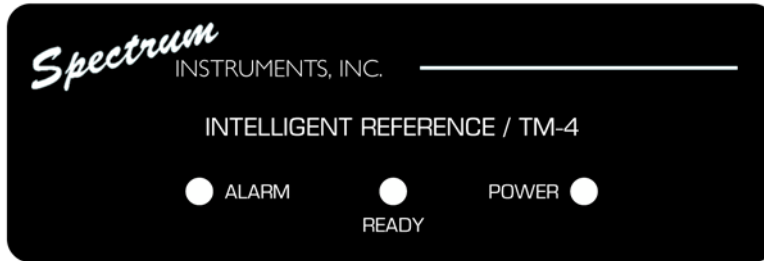
TM-4 FRONT PANEL

The simplest way to supply power to the Intelligent Reference/TM-4™ is by use of an AC adaptor and either the breakout board or data cable. The board, cable and adaptor are all optional accessories and may be ordered from Spectrum. The adaptor plugs into any 120 volt AC outlet and provides a suitable DC voltage source for the unit. The input requirements for the AC adaptor are 105 to 130 VAC, 55 to 65 Hz. The connector on the end of the adaptor cable plugs directly into the power jack on the breakout board or adapter cable, and the breakout board (or cable) connects to the TM-4 by means of the HD 15-pin D-sub cable. See page 44 for a full description of the pin functions and connections.